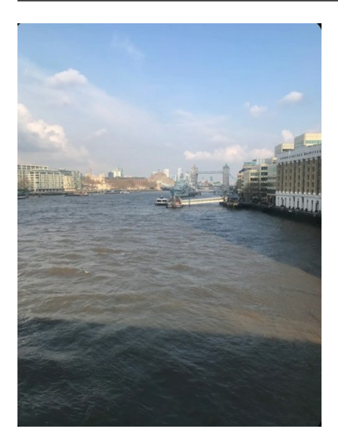
The commute to the London office